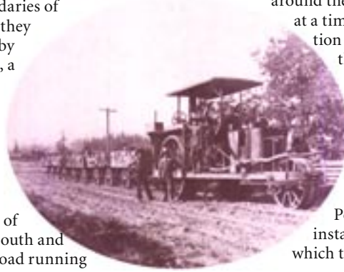
Potter's Mill steam engine transporting railroad ties, c. 1905

In addition to providing employment, the