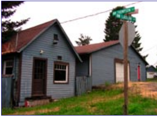
Former Bonny Slope barbershop and store at Laidlaw & Thompson