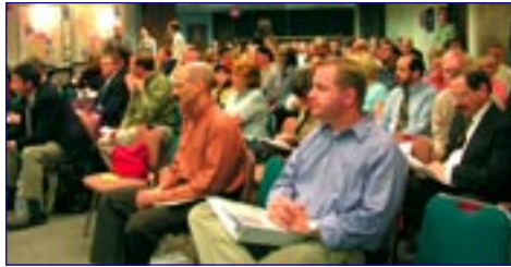
Concerned residents pack the June hearings of the Beaverton Board of Design Review