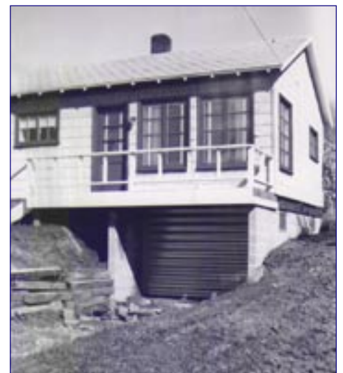
Starter houses growing—the Hoffelner family home getting an underground garage c. 1959