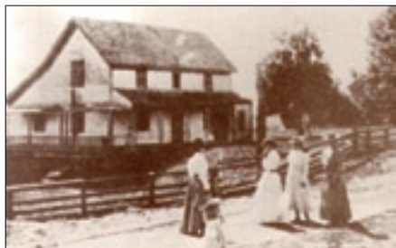
The Cedar Mill post office was located in the JQA Young house, which still stands on Cornell east of the Cedar Mill Bible Church.

Although the mill was abandoned for lack of timber in 1892, the holding pond continued to exist as a community recreation area. For nearly 50 years, local residents swam and fished in the pond. You can still enjoy the natural beauty of Cedar Mill Creek and its falls near the site of the old logging operation.