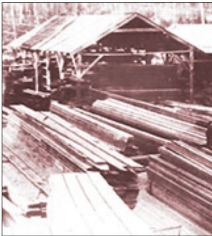
The Cedar Mill near Cornell, 1883

Life and making a living were the principal daily concerns of the pioneers here. One means of livelihood gave its