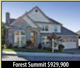
Forest Summit $929,900