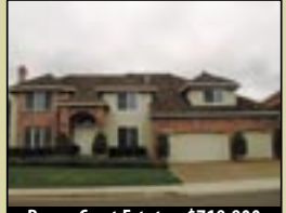
Bauer Crest Estates $719,900