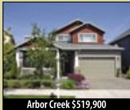
Arbor Creek $519,900