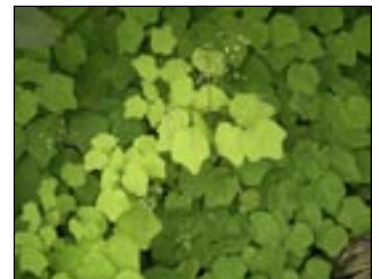
Vancouveria hexandra "duck-feet"

The last genus in our list is Vancouveria and is named for Captain George Vancouver, who explored the Northwest coast in the late 1700s. Vancouveria hexandra ,