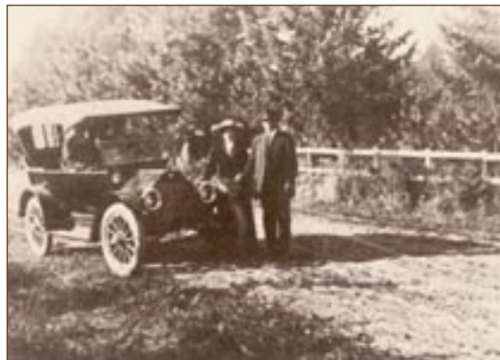
Henry Hamel's 1913 Rio on Kaiser Road near Laidlaw intersection, about 1914. Note the muddy ruts!