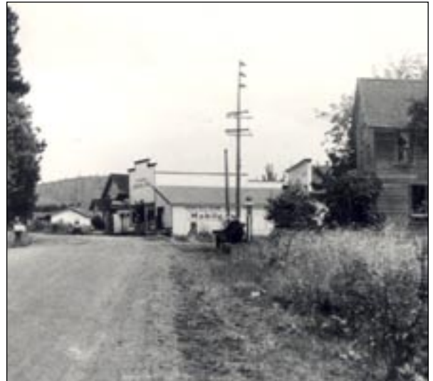
Cornell Road looking east toward Barnes Road intersection in 1938.