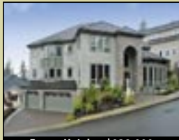
Forest Heights $928,000