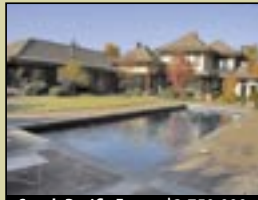
South Pacific Estate $2,750,000