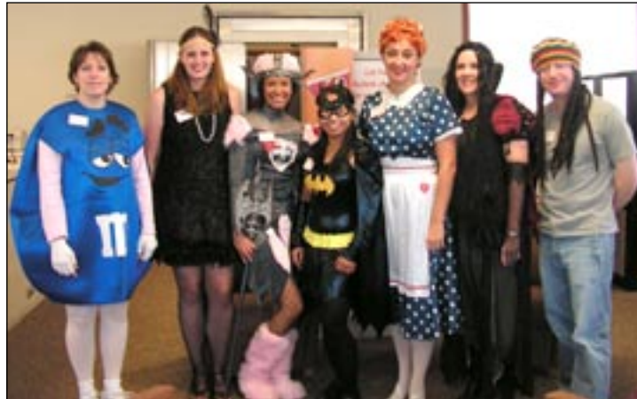
The staff gets into the Halloween spirit