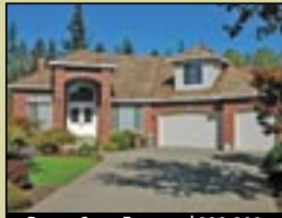
Bauer Crest Estates $899,900