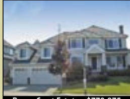
Bauer Crest Estates $779,875