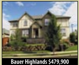
Bauer Highlands $479,900

Outstanding Sales Award Recipient 1997 • 1998 • 1999 • 2000 • 2001 • 2002 • 2003 • 2004 • 2005