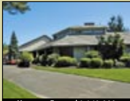
Hartung Farms $1,160,000