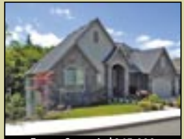
Forest Summit $945,000