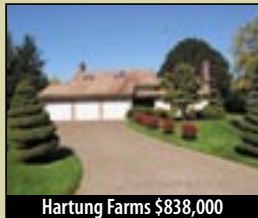
Hartung Farms $838,000