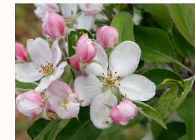
Fruit tree blossoms