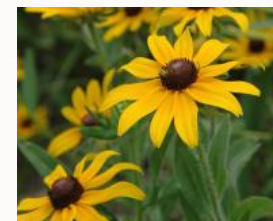
Black eyed Susans