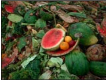
recycling produce at Nature's Needs

Before the material gets collected for composting, however, gleaners from four different organizations go through produce and bakery items that are no longer up to