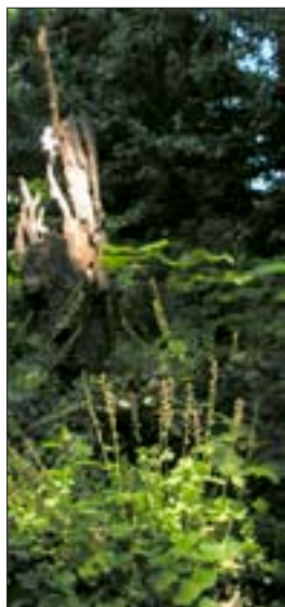
Native fringe cup is a relative of coral bells

Rock Creek Watershed Partners ( rcwp.org ) will be helping the Bartletts host the tour, and will be providing a map of the property highlighting the various micro-climates and planting solutions, along with a list of plants used in the garden. They’ll also be available with advice for those interested in following some of these techniques in their own gardens.