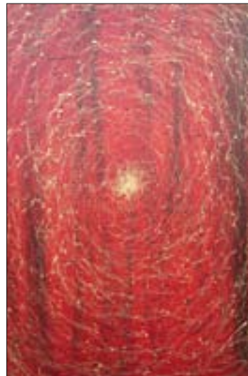
Breath from the Forest, acrylic painting by Danlar