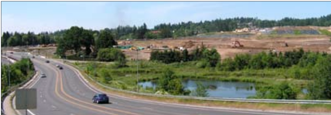
Polygon Northwest's development will include a commercial area on the land along Barnes Road. The Cedar Mill Wetland, foreground, is not part of the development. Timberland housing is being built on the hills above.

7 pm, St. Vincent Medical Center, 9155 S.W. Barnes Road, Souther Auditorium in the East Pavilion. See cpofriends.org for more info.