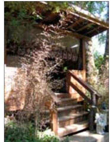
Inspiration for the lanai came from a trip to Hawai’i and was built mostly from wood milled onsite

tour. “People will see the evergreen ‘bones’ of the garden, and they’ll experience the wooded glen features. The vegetable garden should be in full swing by then also,” he says.