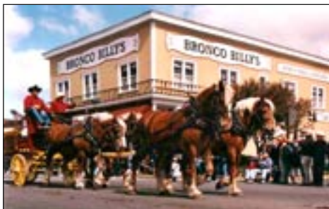
Historical parade held in Sisters, Oregon