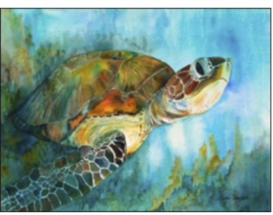
Sea Turtle, by Laura Hopper

June's featured artist in the gallery is Laura Hopper, who paints a wide variety of subjects in many different color palettes, often adding bits of collage, gold-leaf, or other textural elements for interest.