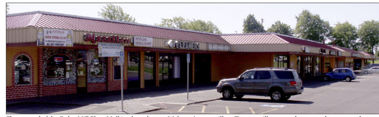
Walgreen's will begin construction soon. The last we heard. they're planning a twostory facility (perhaps with parking above or below?) with a drivethrough pharmacy window. It may be a 24-hour operation. They are go-

next to the liquor store, in addition to the bar at the rear of the building, which they took over from Rococo a couple of years ago. Mazatlan and Thai Lily will move in to the old Rococo space to complete a veritable "restaurant row" for Cedar Mill.