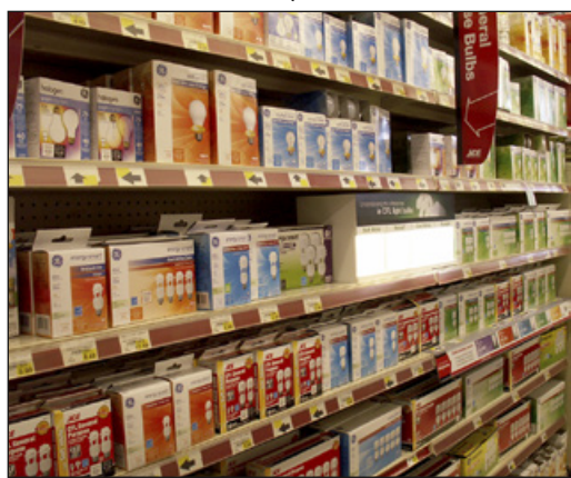
Not only a great selection of energy-saving lightbulbs, but a display to help you figure out color temperature and light level to help you get just what you need.

The building, in the Milltowner Center on the northeast corner of Cornell and Saltzman, is owned by Bales / Findley Property Management. Hi-School Pharmacy had