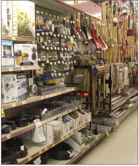
Their garden section includes everything you need to create and maintain a drip-watering system that makes growing your garden easier and more productive.

parking is always available. Their hours are Monday-Saturday, 8 am to 7 pm, and Sunday 9-5. Call them at 503-672-9489, or <u>visit the Ace</u> <u>website</u> to view their current ad and more.