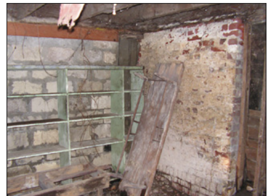
The basement is a jumble of materials, discarded furniture and junk. The latest master plan calls for using some of the stones for low walls around the grounds.