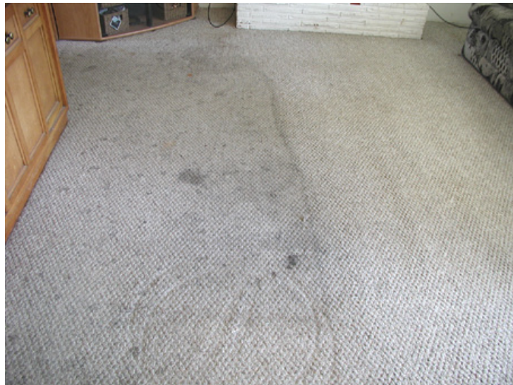
A client took this before-and-after photo and sent it to them on their website.

Find Extract Away on the web at extractaway.com —be sure to check out the special offers—or call them at 503-640-6311.