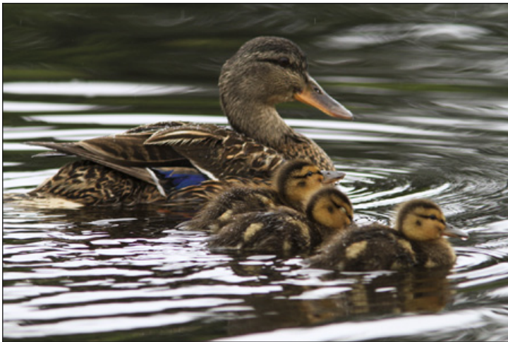
A female mallard and her babies on a Cedar Mill pond this spring.

However for those interested in puzzles and minutia, one can still recognize that there are male ducks mixed in with the females and the juveniles. For Mallards the key feature is the bill. In females all year long the bill is somewhat orange with a black "saddle" like splash over the top. In male Mallards the bill is uniformly yellow or straw colored. This feature is certainly less of a marker when the males have their spectacular green glossy heads in their breeding plumage—who would even look at bills?? But in the winter, when both males and