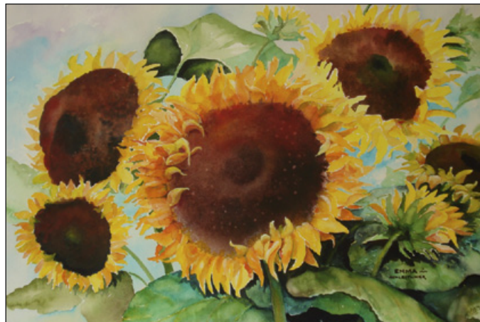
Sunflowers, by Emma Achleitner

Sunset Credit Union is holding their first pumpkin carving/painting contest and all Cedar Mill residents 12 years old and younger are eligible to enter. Simply bring the pumpkin—painted or carved—to Sunset Credit Union (1100 NW Murray Blvd. #200) October 1-28 and we'll take a photo of the child with their pumpkin. Or you can take a photo of the pumpkin and drop it off at the credit union.