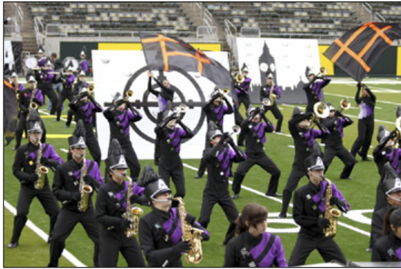
The Sunset Marching Band at last year's Classic

There are many talented students, and many opportunities to appreciate their work. First off, the 23rd Annual Sunset Marching Band Classic took place on Saturday the 8th at the Hillsboro Stadium. This competition hosts more than