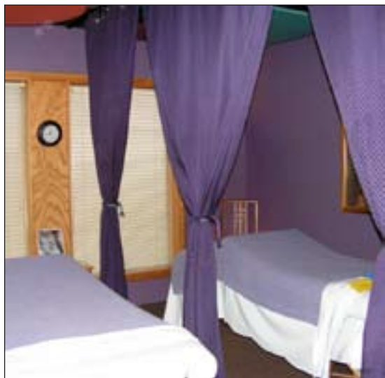
Couples can enjoy a massage together in the double room