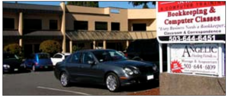
The Westlawn Professional Building is located on Murray north of Cornell

Something that sets AHH apart from many clinics is their scheduling policy. "We purposely schedule at least 15 minutes between appointments—most of the time 30 minutes, just to ensure