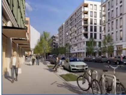
An urban streetscape is planned for the development near Sunset Transit Center

Phase I project (formerly Sunset Town Center Phase 1), the mixed-use project proposed for the land north of the Sunset Transit Center. The project is now proposed to consist of four seven-story mixed use buildings northeast of the existing, unused parking lot adjacent