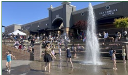
table Last Day of School Celebration! Bethany Village & Bethany Library are hosting a summer kick-off event for students from Beaverton and Portland. Enjoy music, free activities from Bethany Athletic Club, free access to the game truck and a fun and safe environment. Explore various vendors offering Kona ice, crafts, Churros, permanent jewelry, and henna tattoos. Come ready to support and have a great time with us!

Goodbye school, hello summer vacation! Join us for an unforget-