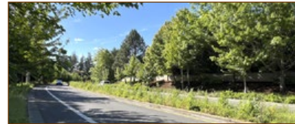
More weeds than landscape plants in the Saltzman medians

We tried to get the Road Maintenance Department to take care of them again this year, but they say it's no longer their responsibility.