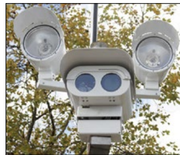
Photo enforcement intersections capture red light violations as well

as speeding violations. Additional intersections have been identified as suitable for expansion of the program; however, there is no timeline for when these intersections may be enabled. The Beaverton Police Department is also working in partnership with the Oregon Department of Transportation to focus on traffic safety awareness, including speed, distracted driving, safety belt enforcement, and enhanced DUII patrol. Learn more about photo enforcement operations at www.BeavertonPolice.org/PhotoEnforcement .