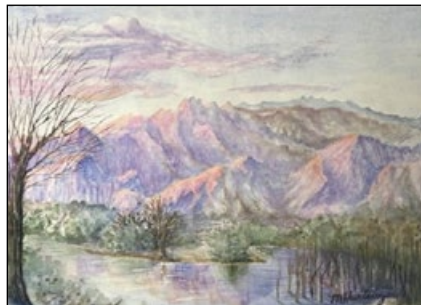
Santa Catalina Mountain Sunset, Tucson, watercolor.

VGA's Instructional Team is collaborating with THPRD on two weeks of art camp sessions. Each session will be unique. Find complete details in THPRD catalog online, or call 503-439-9400.