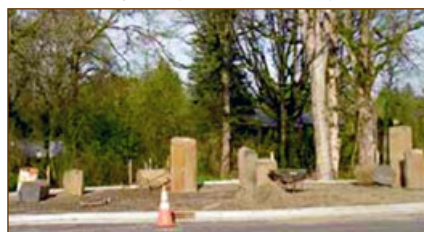
The Overlook area in '09, before the bushes were planted.

It seems that someone (probably a nearby business) has been clearing it regularly, but passers-by often see