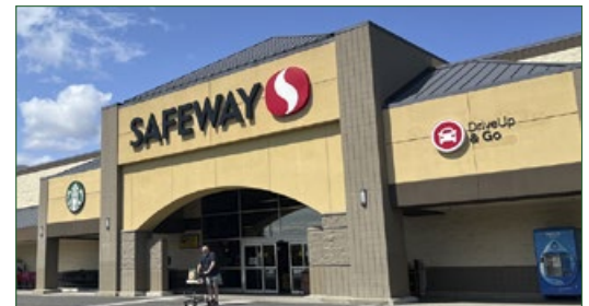
It’s unlikely that a busy store like the Cornell Road Safeway would close if the merger goes through.

From the NW Labor Press : “In addition, several states and other groups are suing to stop the merger. A separate FTC case is set to go