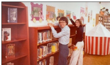
Cedar Mill Library in the '70s